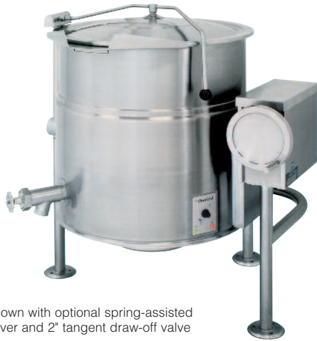
Shown with optional spring-assisted cover and 2" tangent draw-off valve