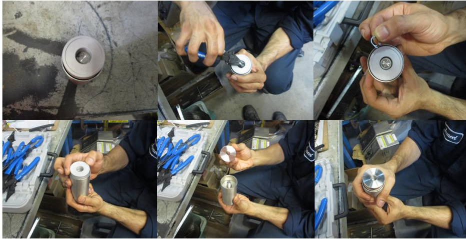
Figure 1 SteamChef™ 6 Re-Placement with new Foot Adapter