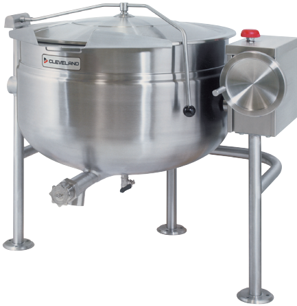
Shown with optional Spring Assisted Cover and 2" Tangent Draw-Off Valve