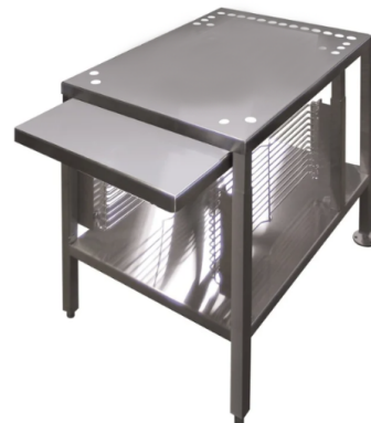
Equipment Stand model Unistand34 with POSK Pull Out Shelf and URK Pan Rack Kit

High Efficiency Boilerless Steamchef™ Convection Steamers