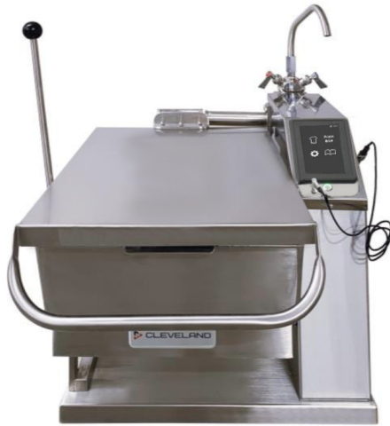
Shown with easyTouch 7" Display Optional Double Pantry Faucet (DPK24)