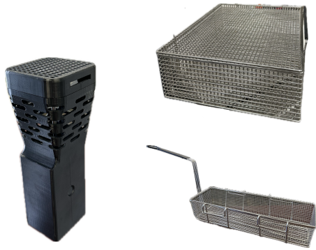
Optional Sous-Vide Pump Optional Sous-Vide & Frying Baskets