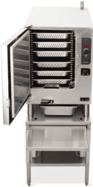
Shown with optional Stand and Cafeteria pans