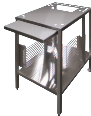
Equipment Stand model Unistand34 with POSK Pull Out Shelf and URK Pan Rack Kit