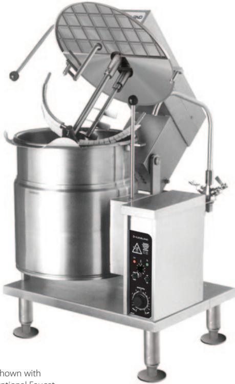
Shown with optional Faucet