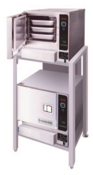
Shown with optional Cafeteria Pans