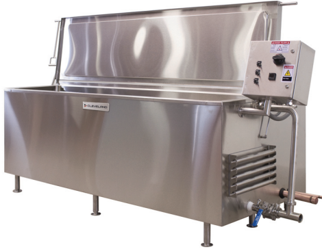
Model shown HBC75