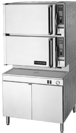
Shown with optional Electronic Timer